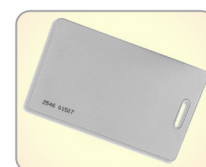
Special EM-ID Middle RangeCard

(Disclaimer: Specifications are subjected to change without prior notice.) *Reading distance depends on tag used & operating environment