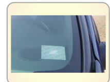
RFID Windshield Sticker