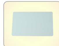
Standard RFID Card

(Disclaimer: Specifications are subjected to change without prior notice.) *Reading distance depends on tag used & operating environment