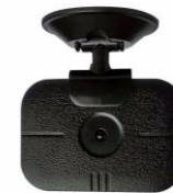
Active tag with suction cap for windshield